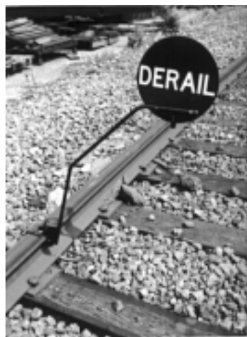
Portable Blue Flag Model RBF & RBFL

Hinge Design. Simply spike base to tie in center of track. To lower, lift staff from holder, then lower to horizontal position. Available with battery-powered blue light accessory. Weight: 12 lbs. w/o light.