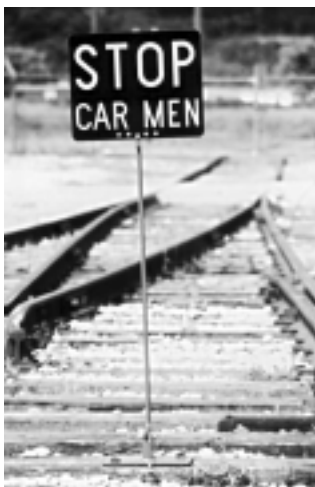
Permanent Blue Flag Model BFH Fold Down Flush Ground Level

All of our Blue Flag Signs meet the requirements of the FRA and OSHA for the protection of workers around or in freight cars and locomotives.